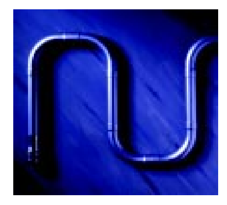
Smooth flow tubing