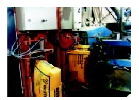
Packing and bagging