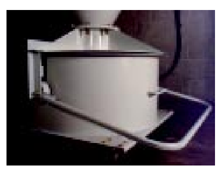
Heavy duty castor type bin (as shown) or other discharge arrangements