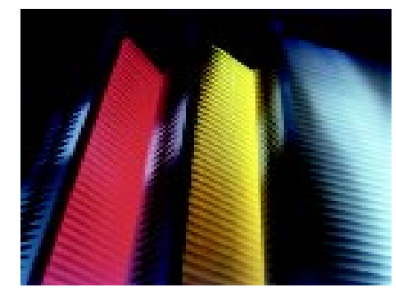
Compact and efficient Unicell cartridge filter elements