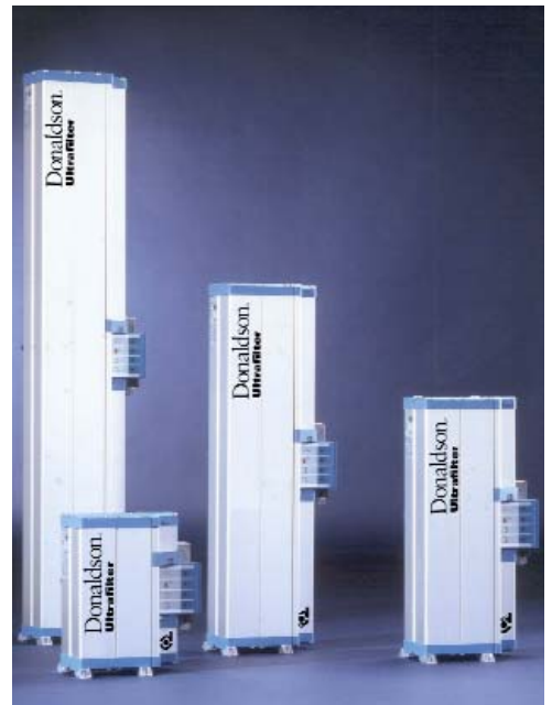
Oilfreepac® 2000 Standard

The final particle filter (3) removes all particles which might be carried over from the adsorption stages. While one vessel with desiccant cartridges is in the drying phase (adsorption), the other cartridge is being dried again (regeneration). A partial stream of dried air is expanded to atmospheric pressure via an orifice (6) and led across the desiccant cartridge for regeneration and via a solenoid valve and a silencer system to atmosphere.